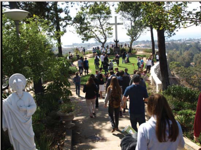
Going to the Point at Kairos

“When the high school closed its doors several years ago as Mission Central Catholic High School, I was very disappointed. It was the only high school for miles around that offered a value-centered and academically rigorous education in the Catholic tradition. It prepared me well for my four years at Saint Mary’s College, Notre Dame, Indiana. What a shame, I thought, that families would no longer have the option of a high school education that builds on the solid foundation of Mission Grammar School. I was astonished and delighted when the school reopened as Mission College Preparatory Catholic High School and eager to support a renewed future for Mission High. Catholic education is a priority in my family. Our three children attended Catholic schools from grade school through College, and our daughter received her master’s degree from a Catholic university. Our first charitable dollars always go to all the alma maters in our family.”