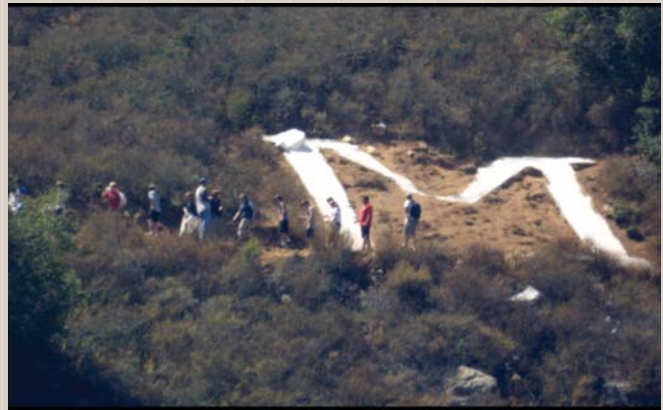
Annual Painting of the “M”