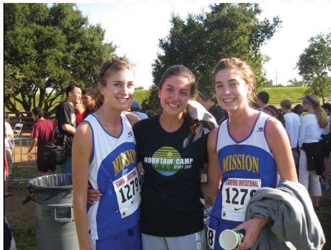
Mooney girls at Stanford Invitation

Football Volleyball Cross Country Girls Tennis